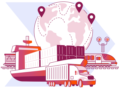
Carriers operating in maritime and inland waterways, road and rail