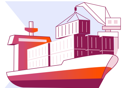
Ultimate consignees (in maritime transport)